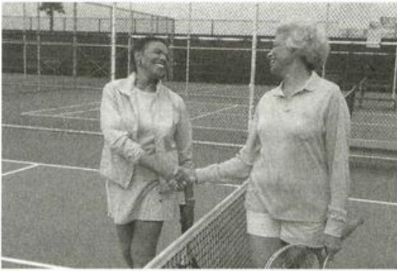
Shaking hands may be a polite acknowledgment of your competitor as well as a greeting.

20 The pressure to compete causes Americans to be energetic, but it also places a constant emotional strain on them. When they retire, they are at last free from the pressures of competition. But then a new problem arises. Some may feel useless and unwanted in a society that gives so much prestige 7 to those who compete well. This may be one reason older people in the United States sometimes do not have as much honor and respect as they have in other less-competitive societies. In fact, generally speaking, any group of people who do not compete successfully—for whatever reason—do not fit into the mainstream of American life as well as those who do compete and succeed.