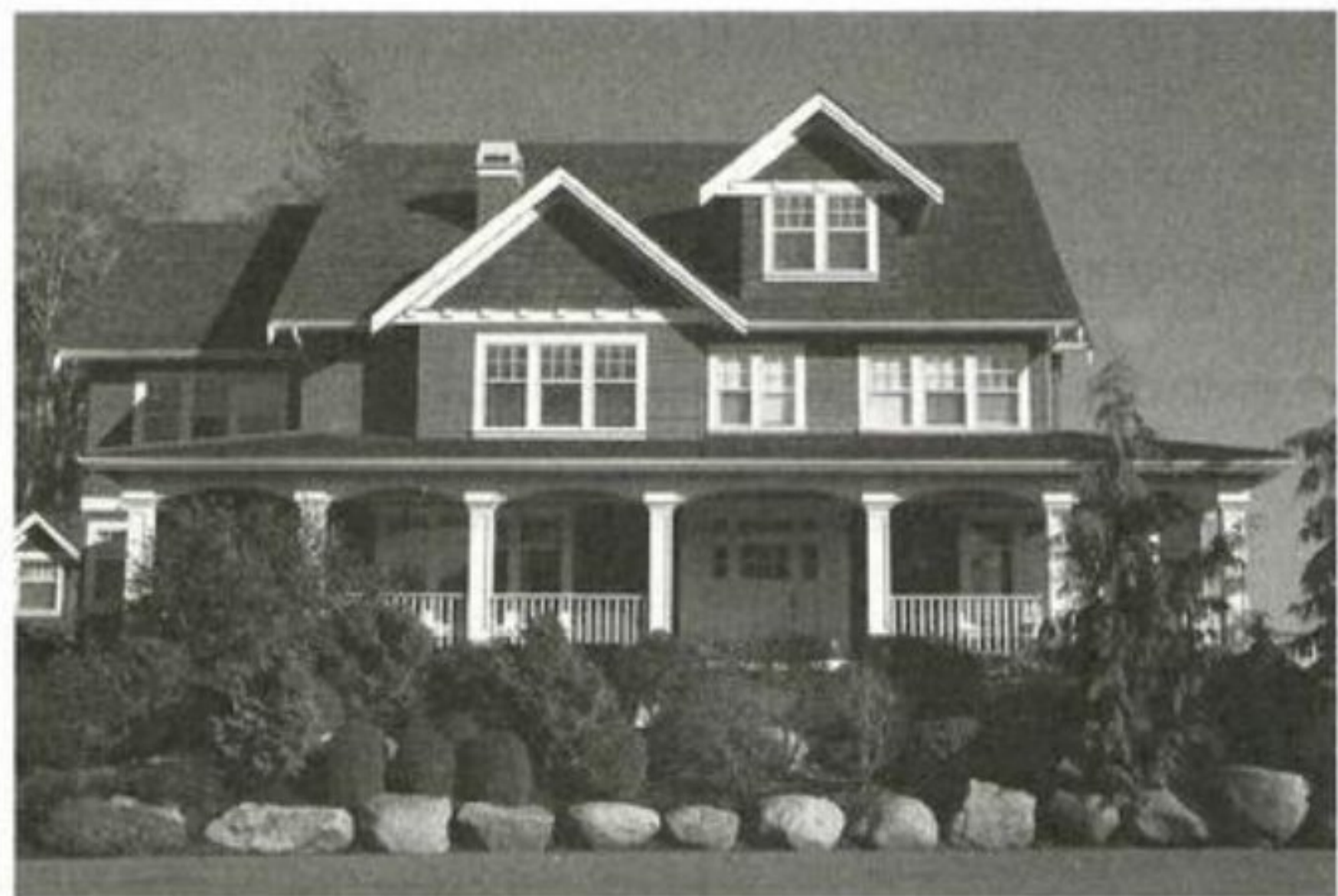
To some, owning a beautiful house means they have achieved the American Dream.