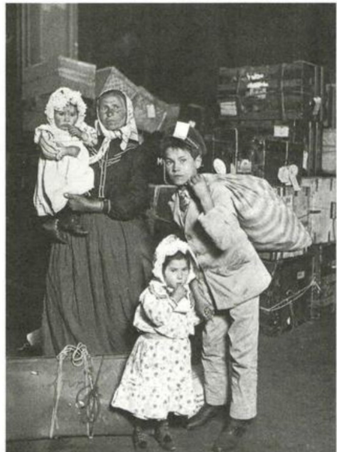
Immigrants on Ellis Island around 1900