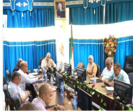
A meeting of the Scientific Council of El Oued University