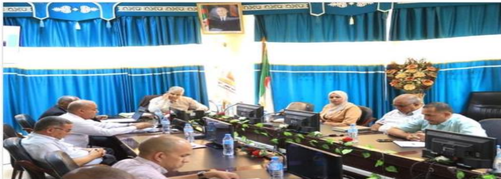
A meeting of the Scientific Council of El Oued University